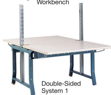
Double-Sided System 1 Workbench