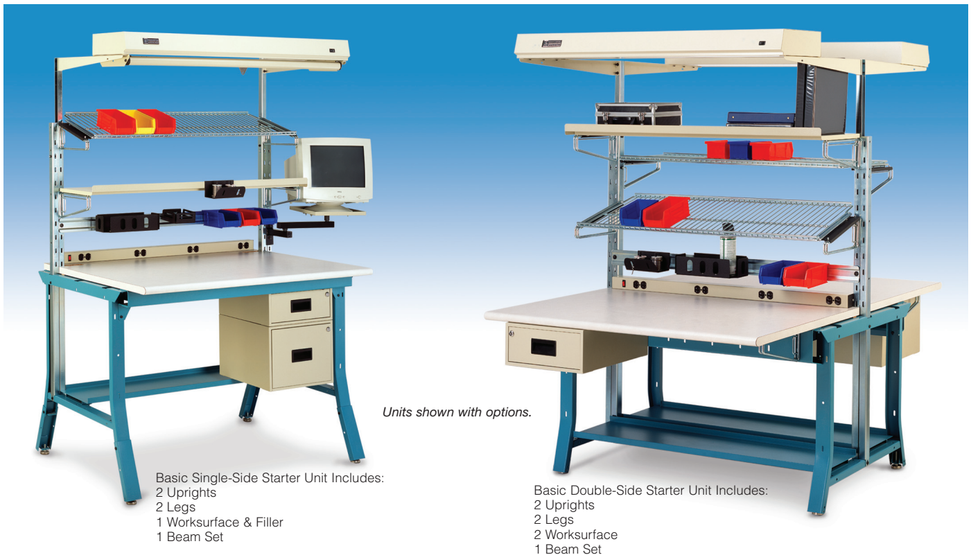
Units shown with options.

Basic Single-Side Starter Unit Includes: 2 Uprights 2 Legs 1 Worksurface & Filler 1 Beam Set