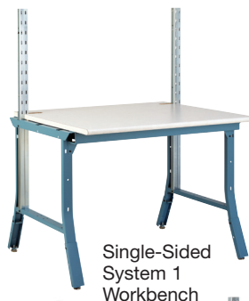
Single-Sided System 1 Workbench

The System 1 is available in single- or double-sided versions. Use it as a stand-alone bench or connect add-ons for an "in-line" series of benches. Cold-rolled, 12-gauge steel construction and H-leg design make these workbenches truly heavy-duty and capable of supporting a 750-pound evenly distributed static load. Worksurfaces are 1-1/4" thick, high-density particleboard, finished with high-pressure laminate and have a 180° rolled front edge for comfort. With the leg extension option (P/N 60009), the worksurface height is adjustable to 30, 33 or 36 inches. A built-in upper structure is slotted in 2" increments making addition of shelving and lighting a snap. Standard paint colors are Cerulean Blue with KT Ivory accents; laminate colors are Ivory Kid (standard) or Beige (ESD).