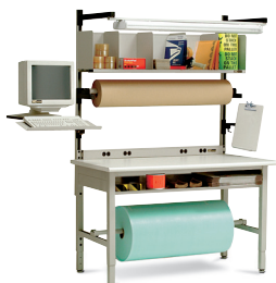
Packaging Accessory Bench

Add shelves, lighting and productivity accessories above the worksurface of just about any workbench with our Multi-Task System (MTS). Sizes to fit 48", 60", 72" and 96" long worksurfaces.