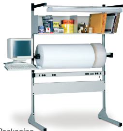
Packaging Accessory Station