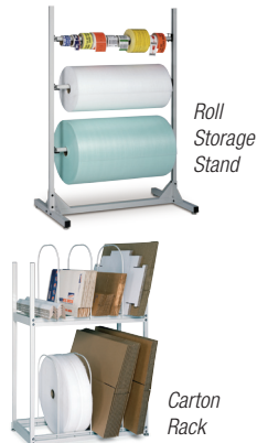
Roll Storage Stand