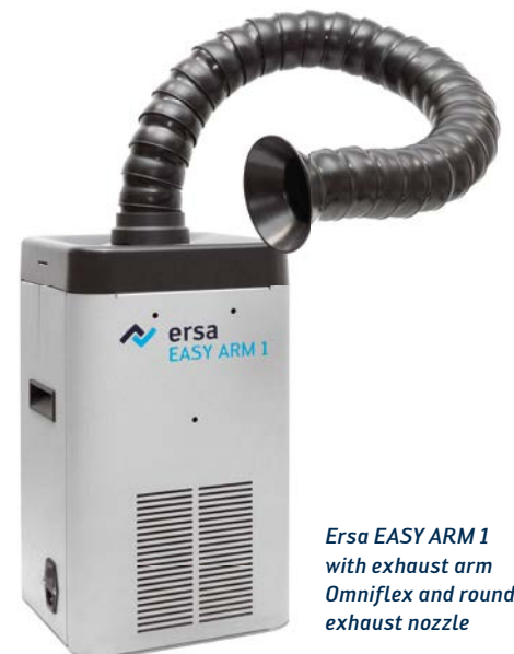
Ersa EASY ARM 1 with exhaust arm Omniflex and round exhaust nozzle

For energy saving purposes and to extend filter lifetime, both units can be connected with Ersa i-CON soldering stations or a standby switch. In this way, the extraction unit is only working whilst the attached soldering station is in operation, stopping as soon as the soldering station goes into standby mode.