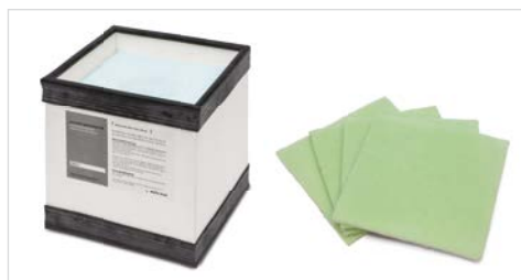
High-end filter materials, same filters for EASY ARM 1 and EASY ARM 2