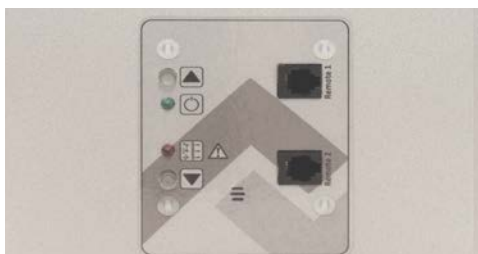
Clearly structured control panel